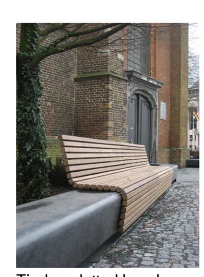
Timber slatted benches