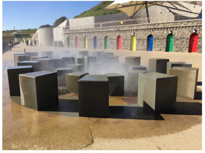
Mister jets with LED lighting