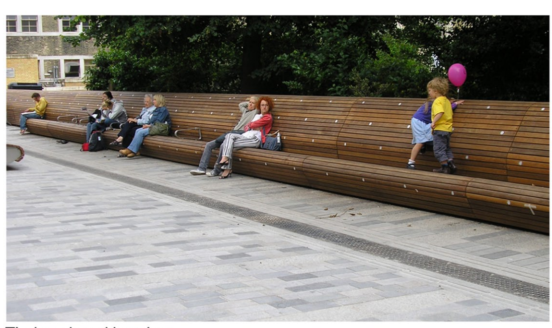
Timber slatted benches