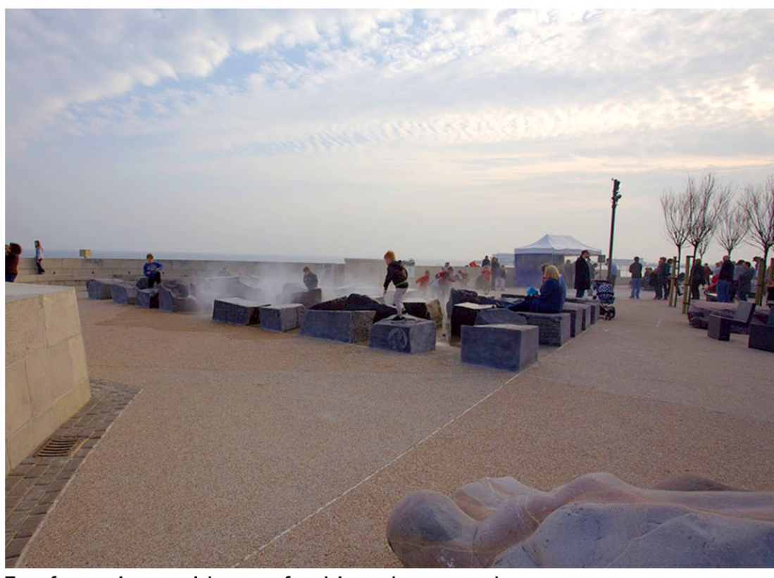
Fog fountain provides a refreshing playground